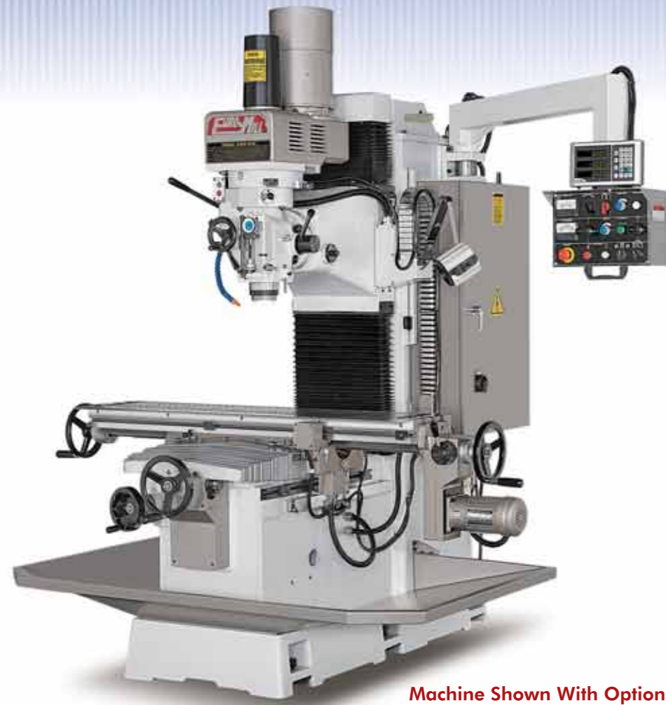
Machine Shown With Optional Accessories

5HP Inverter Variable Speed Head , Spindle Brake