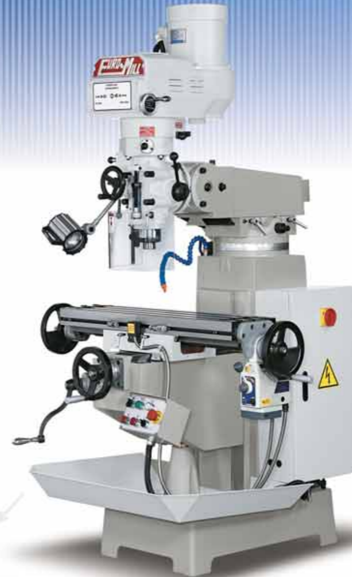
Machine Shown With Optional Accessories