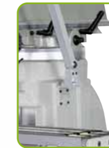
New 2V humpback machine body, rigid and stable.