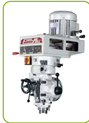
VA Step pulley