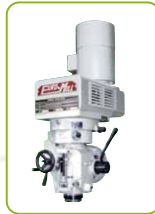
Vi Inverter variable