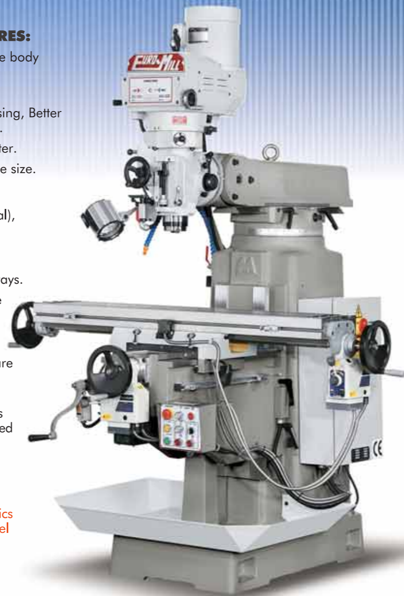
Machine Shown With Optional Accessories