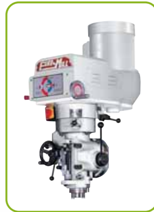
VS Mechanical variable