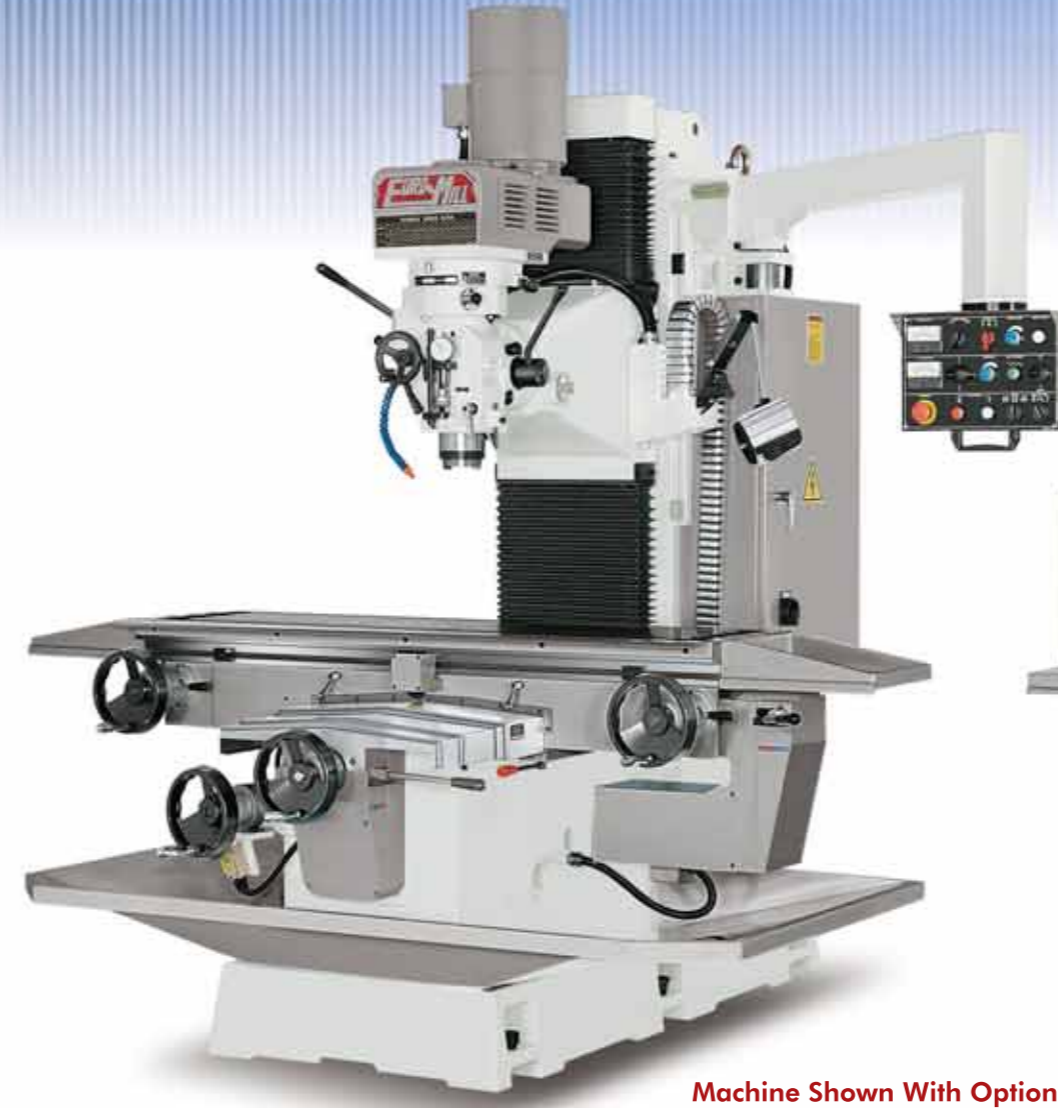
Machine Shown With Optional Accessories

5HP Inverter Variable Speed Head, Spindle Brake