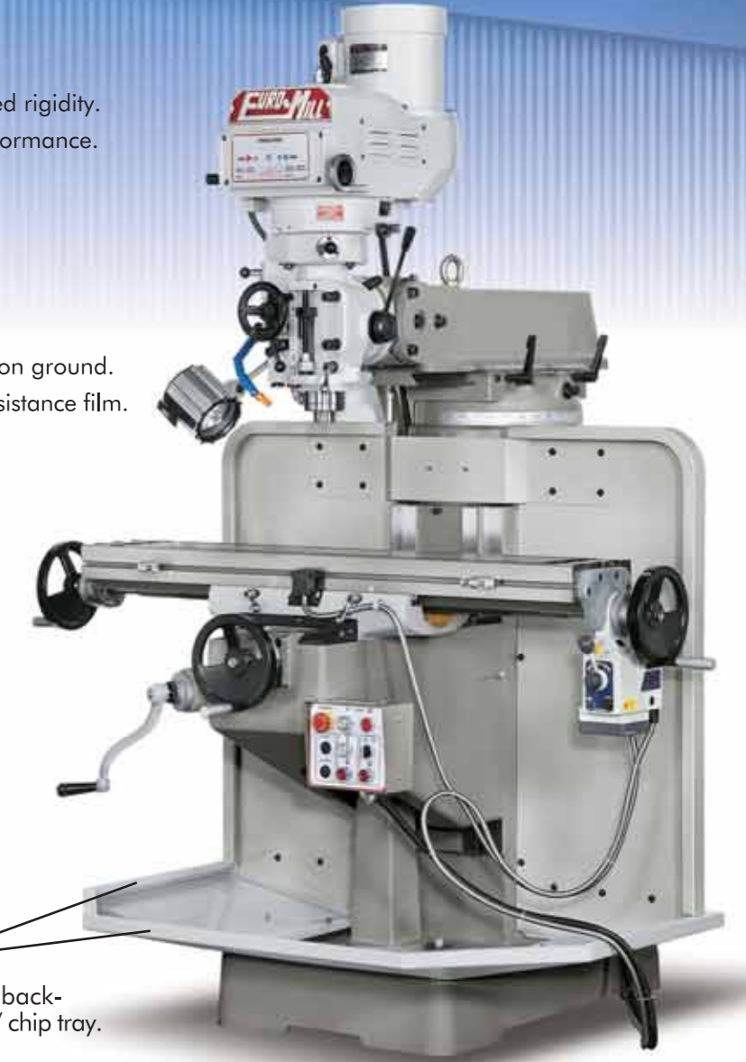
Machine Shown With Optional Accessories